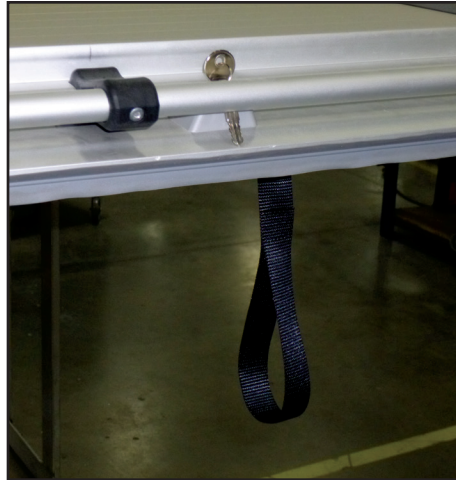
Pull strap assists in closing cover (manual cover shown with optional key lock)