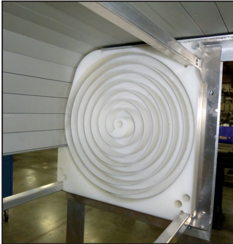
Cover stores neatly inside the bed using this simple coil system