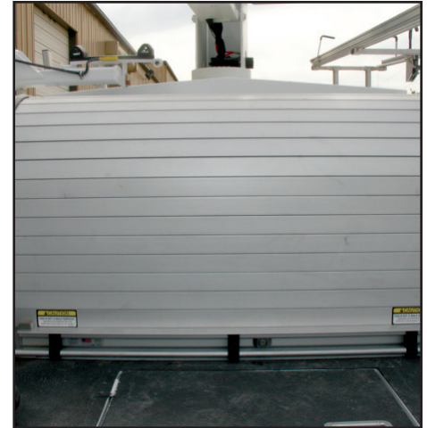
Service body (manual cover shown). Inquire about minimum and maximum widths