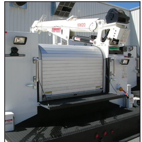
Service bodies (motorized cover shown). Inquire about minimum and maximum widths

6800 E. 163rd Street • Belton, MO 64012 • 800.827.3692 • rom.orders@safefleet.net