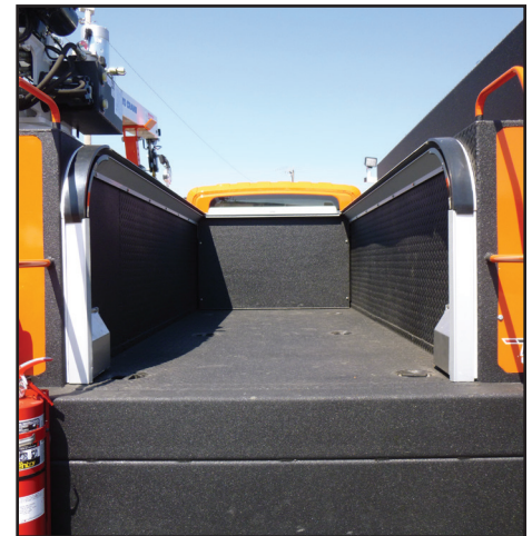
Service bodies (motorized cover shown). Inquire about minimum and maximum widths