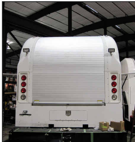
Wireline bodies (motorized cover shown). Inquire about minimum and maximum widths