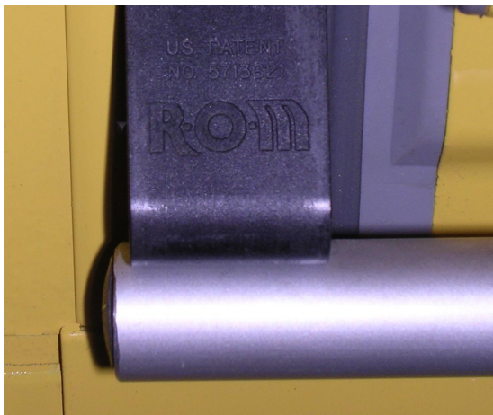
Previous Lift Bar Configuration

Now, our new lift bar configuration will eliminate the need for shimming. If the door will physically fit and operate with an out-of-tolerance door opening, the Door Ajar Switching System (DASS) will also work. This is accomplished by extending the length of the lift bar by approximately 5/16" past the strike blocks on each side. Also, the end caps have been redesigned to better match the profile of the lift bar.